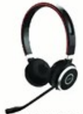
Jabra Evolve 65SE Stereo