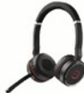
Jabra Evolve 75SE Stereo