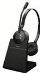
Jabra Engage 55 Stereo