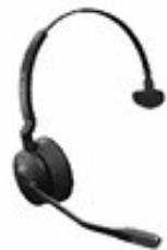
Jabra Engage 55 Mono

Purchase through authorized resellers, distributors, or from the manufacturers.