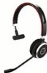
Jabra Evolve 65SE